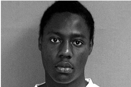
Umar Farouk Abdulmatallab